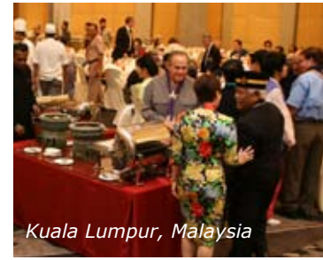
Kuala Lumpur, Malaysia