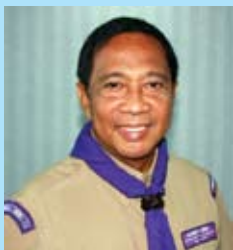
Hon. Jejomar C Binay

As Chairman of the Asia-Pacific Regional Scout Committee, I would like to express my most sincere thanks to the benefactors and supporters who continue to support the APR Scout Foundation.