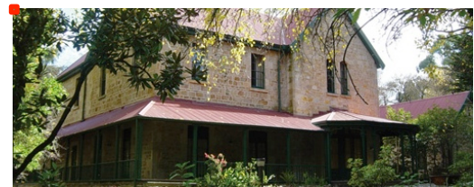
Old House, Woodhouse

the stunning Piccadilly Valley, just 25 minutes from the Adelaide GPO. Woodhouse offers arguably the best group accommodation facilities in the state, for school camps, conferences, families, weddings and almost any camping option that you can conceive. Woodhouse offers three separate accommodation centres: the heritage-listed 'Old House', The Bunkhouse and The Rymill Conference Centre, along with unmatched under canvas camping and undercover cooking facilities.