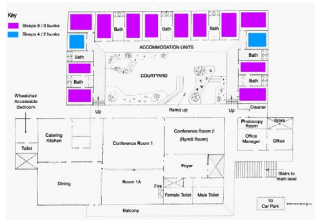
Rymill Centre Layout (our accommodation & forum venue)